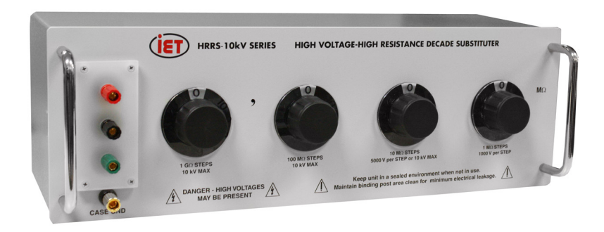
Figure 1-1: HRRS-10kV Series High-Resistance, High-Voltage Decade Substituter

Applications include calibration of meters and megohmmeters, and checking of electrochemical and biomedical sensors and instruments. These instruments are useful wherever high resistances are required, such as in testing high-impedance amplifiers and the insulation of low-power circuits.